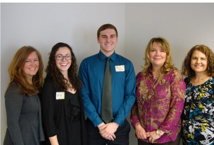
Harford Community College Undergraduate Team

University of Maryland “Best Graduate School” project for “Gold Street Park – Druid Heights” – The students worked with the Druid Heights community in Baltimore, Maryland to explore the potential of a vacant lot in the neighborhood that negatively impacted the revitalization of the area. Collaborating with the neighborhood, the students designed a community park plan with a meditative space, a nature play area, terraces for community events, water features and a bio-retention area that helps to revitalize and transform this community.