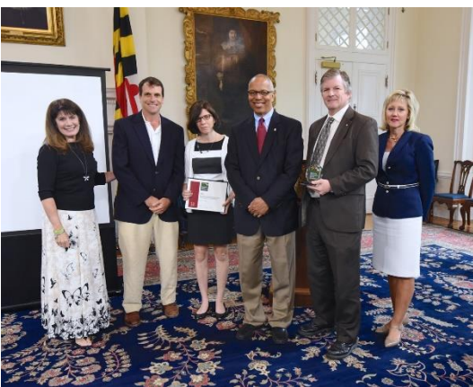
Representatives of the 520 Park Avenue project

Videos detailing each award winning project may be viewed on Planning's website at: planning.maryland.gov/YourPart/773/MSGC_Awards2016.shtml .