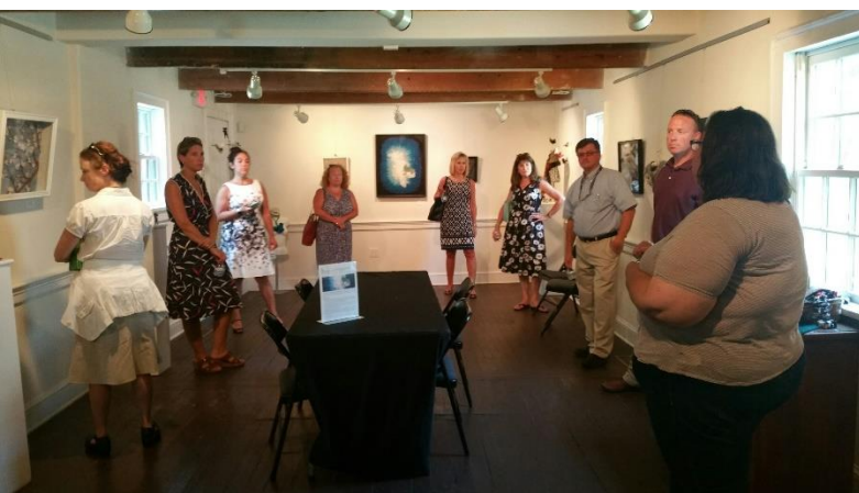
Members of the Growth Commission gain insight about the local communities where they meet, touring local attractions and businesses. Pictured here, a group of commissioners learn about the Fiber Arts Center in Denton.

The Commission's Adequate Public Facilities Ordinance (APFO) Workgroup is also continuing to study the reports of local jurisdictions with adopted APFOs to determine if APFOs are redirecting development away from Priority Funding Areas. The Workgroup's preliminary assessment has been that local reports indicate statewide growth pressures have not returned to pre-Great Recession levels to provide sufficient evidence that APFOs are redirecting development beyond some localized restriction. In addition to the work with APFO's, the Commission has been reviewing the Transfer of Development Rights