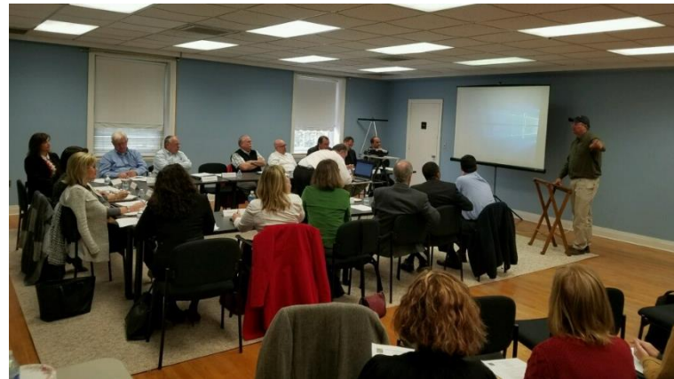
The Maryland Sustainable Growth Commission meets bi-monthly rotating at locations throughout the state. Pictured here, the commission met at Chestertown Town Hall in November.

With the appointment of many new members to the Growth Commission in 2016, much of the Commission's attention has focused on learning first-hand about the growth challenges facing local governments, particularly in the rural parts of Maryland – visiting Allegany, Caroline, Harford and Kent Counties. The Commission has continued to work on the recommendations from the Reinvest Maryland: Accelerating Infill, Redevelopment & Community Revitalization report, identifying how state and local governments can work together to spur reinvestment into our existing communities. Additionally, the Commission's Rural Economies Workgroup made significant progress investigating local food production opportunities, enhancements to Maryland's forestry industry, the needs for continued state land preservation efforts, and reducing impediments to rural development.