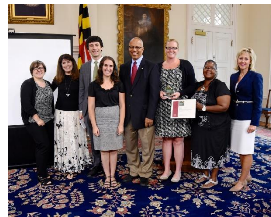
Civic Works' Retrofit Baltimore Program