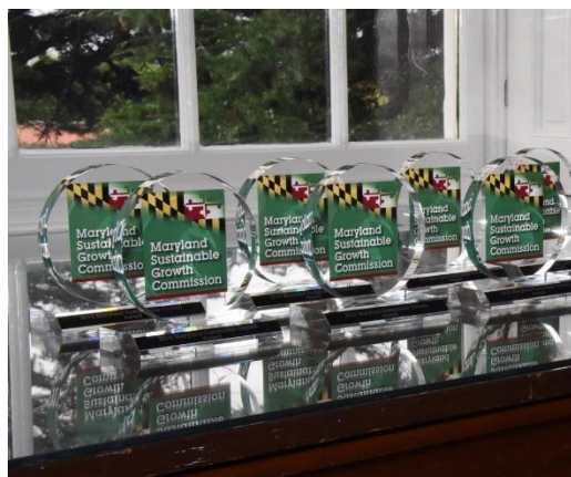
Maryland Sustainable Growth trophies