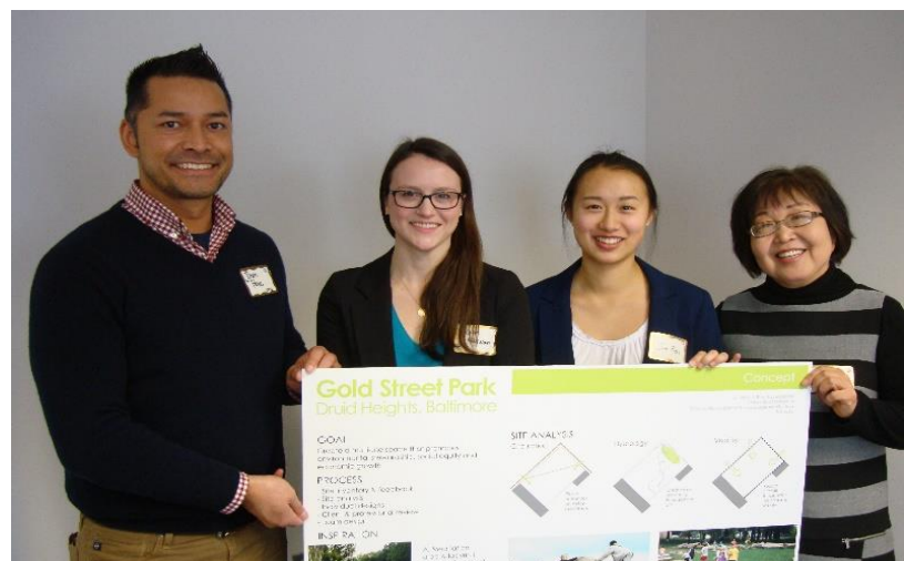
University of Maryland Graduate Team