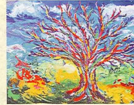
Lyndi McNulty "Wye Oak"